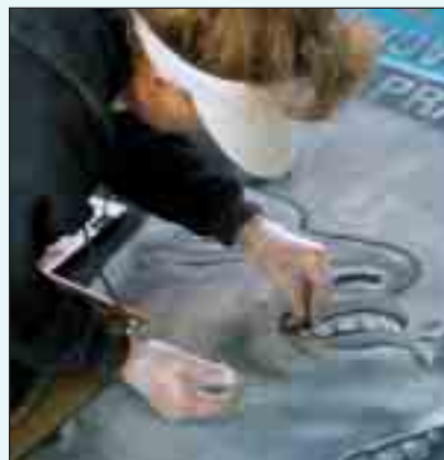
Italian Street Painting Festival